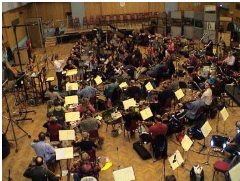
Abbey Road Studios No 1, with the London Metropolitan Orchestra

The Ultimate One-Stop Film Music Company